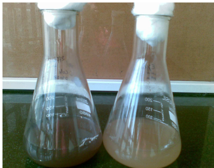
Fig. 3: Degradation of mixture of 7 dyes by transformed E. coli X1 (82.54 %)